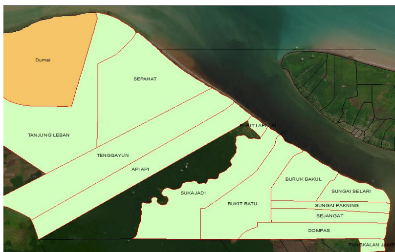
Figure 1. Map of Villages on the Coastal Area of Sumatra Island in Bengkalis Regency

The purpose of this study is to determine and evaluate viable approaches for incorporating the Sustainable Development Goals (SDGs) into sustainable development in coastal communities in Bengkalis Regency, Sumatra Island. The study will concentrate on thirteen villages—Tanjung Leban, Sepahat, Tenggayun, Api-Api, Parit I Api-Api, Sukajadi, Bukit Batu, Buruk Bakul, Sungai Selari, Sejangat, Dompas, Pangkalan Jambi, and Sungai Siput—that are situated on the coastline region of Sumatra Island in Bengkalis Regency.